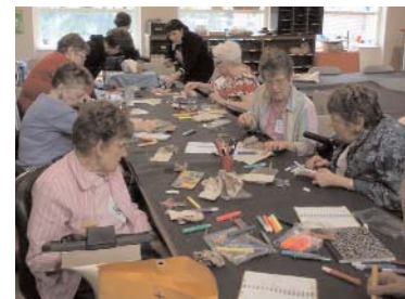
The Post-Polio Wellness Retreat , facilitated by nine faculty members, was attended by 46 polio survivors, 15 caregivers/spouses from three countries and 21 states.