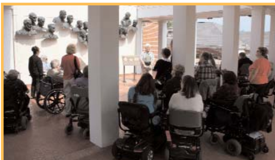
Tour stop at the Polio Hall of Fame